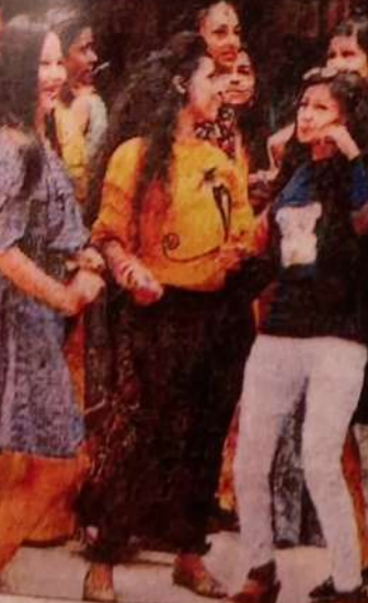
श्री गुरु नानक गल्स डिग्री कॉलेज फ्रेशर्स पार्टी के दौरान डांस और मस्ती करती छात्राएं।

इसके फलस्वरूप छात्राओं में जागरूकता बढ़ेगी। छात्राओं को जागरूकता अभियान 'कथा' का आयोजन