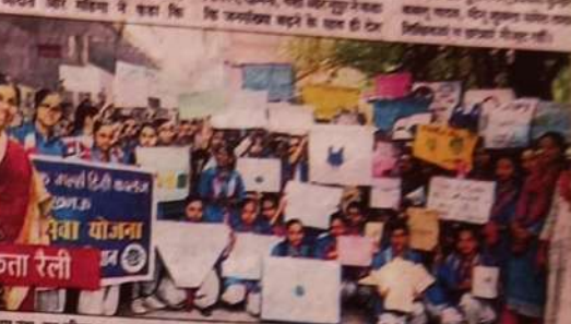
प्लास्टिक मुक्त बन रहा, यह उद्देश्य का इशारा। छात्राओं ने रैली में भाग लिया।