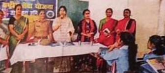
श्री गुरु नानक गल्स कॉलेज में हुए जागरूकता अभियान 'कथा' का आयोजन