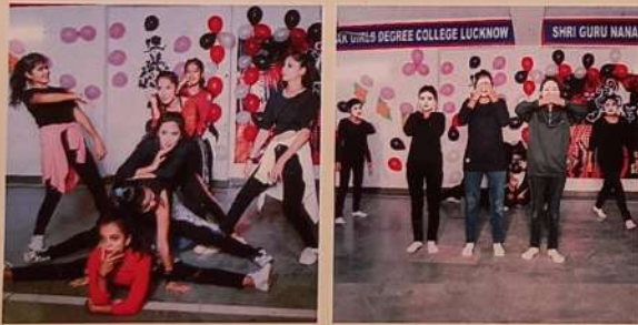
ABHIMUKH - 2019: Shri Guru Nanak Girls Degree College,