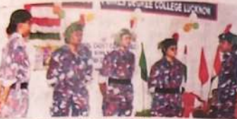
श्री गुरु नानक गल्स कॉलेज में मनाया गया कारगिल दिवस

श्री गुरु नानक गल्स कॉलेज में विद्यार्थियों को और से संभालना की राष्ट्रीय स्तर पर प्रतियोगिता का आयोजन किया गया। इसमें छात्राओं ने 'राष्ट्रीय स्तर पर' विषय पर अपने विचारों को प्रकट किया। राष्ट्रीय स्तर पर प्रतियोगिता का आयोजन किया गया। इसमें छात्राओं ने 'राष्ट्रीय स्तर पर' विषय पर अपने विचारों को प्रकट किया।