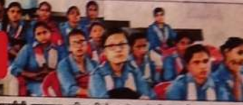
एनबीटी, सखनऊ : पब्लिक निवेदन में पुरुषों की प्राथमिकता को ध्यान में रखते हुए