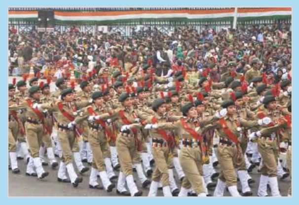
the 10 day Advance Learning Camp from 19/11/2014 to 28/11/2014 at Assam.